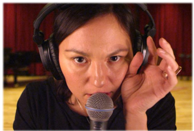
Tanya Tagaq films her interview for A Thousand Thoughts .